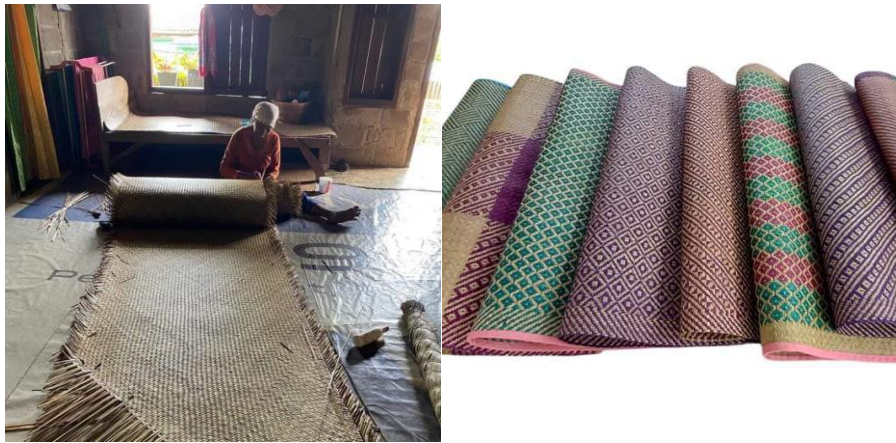
Figure 2. A craftsman and some handicrafts from purun

Handbags, memento boxes, wallets, tissue boxes, and wastebaskets are among the derivatives. In addition, artisans do not have a set production time; instead, they rely only on the time they spend willingly.