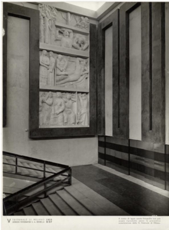
Figure 2. Marino Marini, "Nuova regina" (New queen), 1933 [destroyed]. Plaster, unknown dimensions.