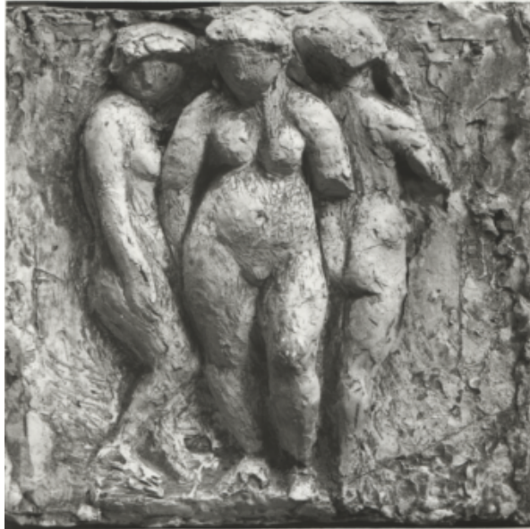
Figure 13. Marino Marini, "Le tre Grazie" [The three graces], 1943. Plaster, 17 63/64 x 18 17/64 x 3 15/32 in. (45.7 x 46.4 x 8.8 cm). Palazzo del Tau, Pistoia.