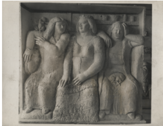
Figure 6. Marino Marini, detail of “Nuova regina” [New Queen], 1933 [destroyed]. Plaster, unknown dimensions.

Yet, some examples made by Marini between 1937 and 1938 seemed to disprove this assumption. In the preparatory reliefs for the Monumento alla Vittoria in Piazza Fiume in Milan and for the Casa Littoria in Rome, he abandoned the monumental forms and Sironi's syntax. Instead, produced a more linear type of relief, similar to the fifteenth-century stiacciato , in these years distinctive of Lucio Fontana's plastic language. 21 This change of direction was due to the need to give preeminence to the architectural structure, as was clearly required by the notices outlining the competition for the two buildings. 22