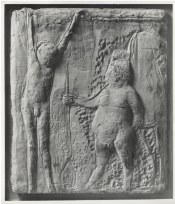
Figure 19. Marino Marini, "Crocifissione" [Crucifixion], 1940s. Bronze, 16 27/64 x 13 47/64 x 1 7/64 in. (41.7 x 34.9 x 2.8 cm). Palazzo del Tau, Pistoia.