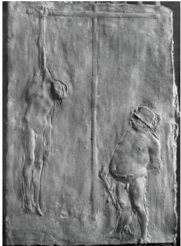
Figure 20. Giacomo Manzù, "Crocifissione con soldato" [Crucifixion with soldier], 1942. Bronze, 16 11/32 x 11 39/64 in. (41.5 x 29.5 cm). Galleria Nazionale d'arte moderna, Rome. Published in Giacomo Manzù, scultore, ed. Carlo Ludovico Ragghianti (Firenze: Vallecchi, 1957).