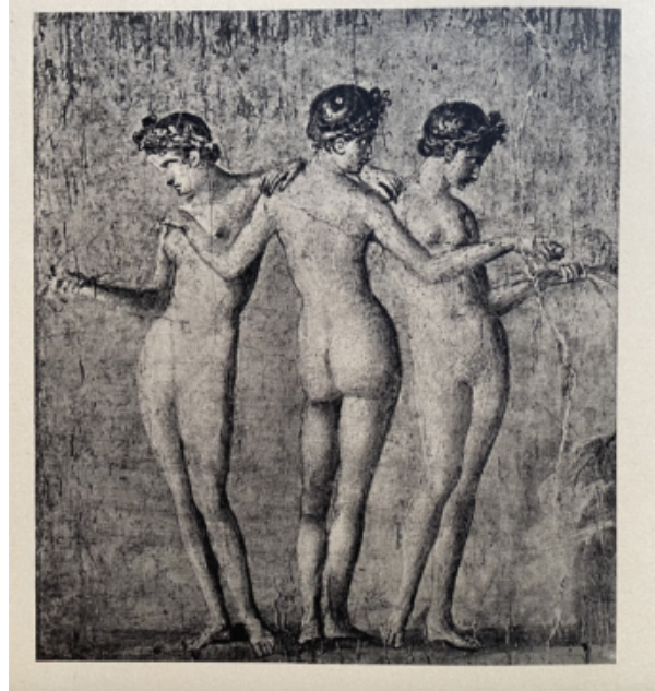
Figure 14. "The three graces," Pompeian fresco from third quarter of the first century A. D. Published in Pittura etrusca-italo-greca e romana , ed. Pericle Ducati (Novara: Istituto geografico De Agostini, 1941).

Two other pieces made by Marini in 1943, given the generic title of Composizione (Composition), seem to be variations of the same theme, but with significant differences. While maintaining a composition based on three figures in one tile, they reinvent the characters' poses to such an extent that they almost no longer resemble the original, ancient model. The contours between the figures and the background are also hollowed out and ragged, so that the boundary between them is impalpable. Finally, in the relief also known as Le tre signore a passeggio (The ladies on a walk; figure 15), 44 built with broken shapes reminiscent of Cubist grammar, some details of contemporary life (such as the high heels of the two women at the center and to the right) remove the figures from the timeless universe of ancient myth.