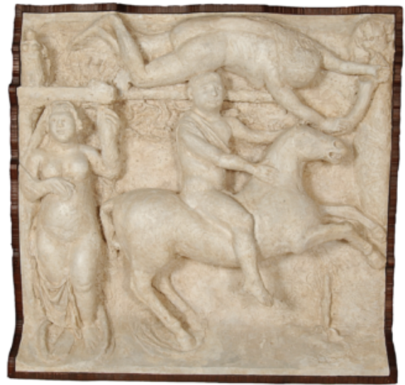
Figure 12. Marino Marini, "Le cinque giornate di Milano" [The five days of Milan], 1939–41. Preparatory plaster relief for the Palazzo dell'Arengario, Milan, 53 15/16 x 55 29/32 in. (137×142 cm), Livorno, Guastalla's Private collection.

A formal suggestion for the plastic contrast between the flat and rough background, and the turned figures emerging in high relief could have come to Marini from the reading of Auguste Rodin's Entretiens réunis par Paul Gsell , of which Marino kept a copy in his library. In the volume he could in fact find some important teachings, especially regarding the conception of the surface as the extremity of a volume, and the vision of the shapes not in extent, but in depth. 38 Already in the last years of the nineteenth century, many Italian sculptors had returned to look at the French master, taking an interest above all in the contrast, derived from Michelangelo, between the unfinished surface and the smoothness of the main figure. 39 Notably even Domenico Trentacoste, who taught Marini during his student days at the Accademia di Belle Arti di Firenze, had done so.