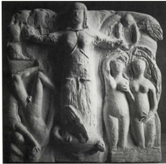
Figure 10. Marino Marini, "Roma contro Cartagine" [Rome against Carthage], 1939–40. Preparatory plaster relief for the INFPS Building in Rome, dimensions and location unknown. Published in E42: Utopia e scenario del regime, ed. Maurizio Calvesi, Enrico Guidoni, and Simonetta Lux (Venice: Marsilio, 1987).

apparatus. 32 In his preparatory relief, probably centered on the propagandistic theme of Rome versus Carthage, 33 figures of Romanesque memory stand out clearly from the background, with prominence given to the female ones (figure 10).