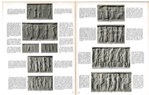
Figure 9. Illustrations of Mesopotamian cylinders reproduced from Le Musée du Louvre: Mésopotamie, Canaan, Chypre, Grèce . Photographies inédites par Andre Vigneau, ed. André Vigneau (Paris: Éditions Tel, 1936). Courtesy Fondazione Marino Marini, Pistoia.

The two groups of reliefs from 1937 and 1938 proved to be the exceptions that confirmed the rule. A few years later, while planning sculptural works for two different architectural contexts, Marini would in fact return to more congenial forms of high relief. Most significantly, both in the relief initially intended for the Palazzo dell'INFPs in Rome (home of the Istituto Nazionale Fascista Previdenza Sociale, built in 1939–40) and in those designed for the Palazzo dell'Arengario in Milan (c. 1937–56), the choice of high relief coincided with the return to the female nude.