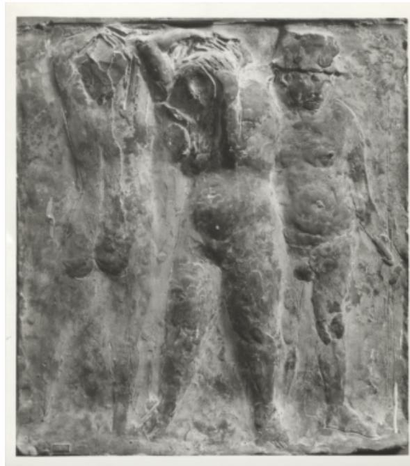
Figure 16. Marino Marini, "Composizione" [Composition], 1943. Bronze, 16 59/64 x 16 17/64 x 1 57/64 in. (43 x 41.3 x 4.8 cm). Palazzo del Tau, Pistoia. Courtesy Fondazione Marino Marini, Pistoia.

Both the tragic pose of the figures on the left and at the center and the mysterious male nude on the right seem to take into account the art scene of their time. In the early 1940s, several Italian artists had portrayed the disasters of the Second World War by turning to the Christian iconographic tradition. For instance, the bas-relief Adamo ed Eva (Adam and Eve, 1940, from the Capricci series; figure 17) by the Bolognese sculptor Luciano Minguzzi modernized the fifteenth-century Progenitori painted by Masaccio for the Brancacci Chapel in the church of Santa Maria del Carmine in Florence, reworking the pair's poses. In fact, as one of his drawings published in the magazine Architrave in 1940 shows, 45 Minguzzi must have found a model of expressive gestures in the Renaissance painter, who was, in those years, the object of widespread study. 46 Although it is difficult to imagine that Marini would have seen this panel, which was exhibited and reproduced in a volume for the first time in 1946, 47 the formal closeness between the two reliefs prompts the supposition that, independently from Minguzzi, Marini had found an interesting visual source of eloquent gestures in Masaccio's depiction of the expulsion of Adam and Eve.