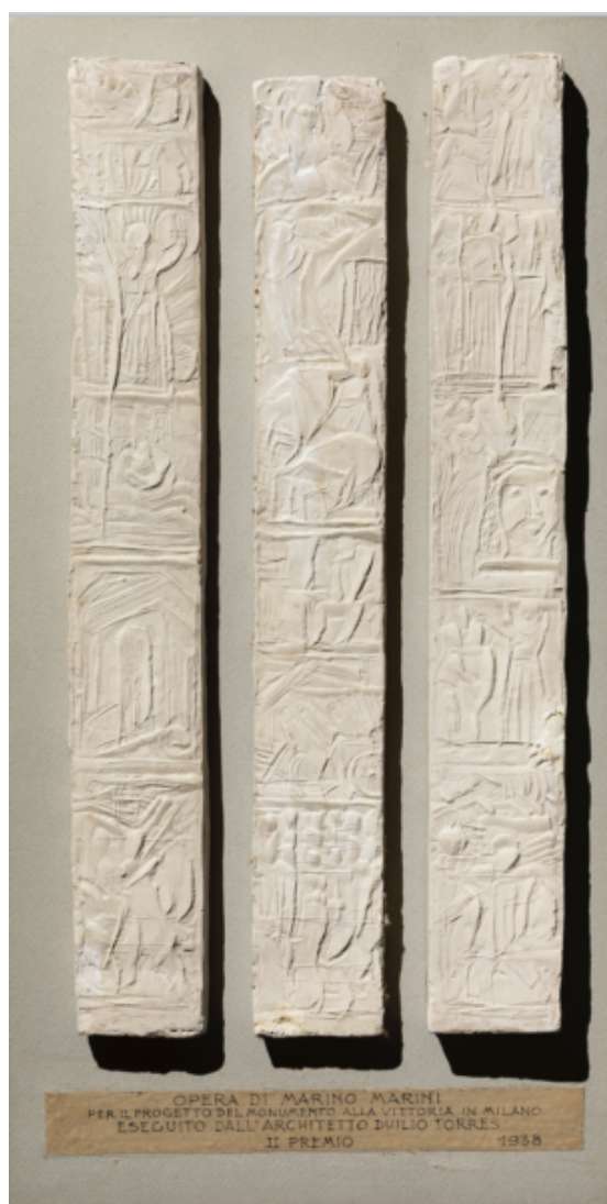
Figure 7. Marino Marini, preparatory reliefs for the “Victory Monument” project by architect Duilio Torres, 1938. Three plaster reliefs in a wooden and glass case, 2 23/64 x 12 13/64 x 23 5/8 in. (6 x 31 x 60 cm).

Edoardo Persico the year before, in Domus . 26 The resumption of the illustrious model did not only help to solve complex narrative problems, it was also part of the project, strongly advocated by Benito Mussolini, to reappropriate symbols of the Romanità .