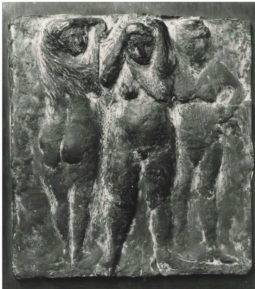
Figure 15. Marino Marini, "Composizione" / "Le tre signore a passeggio" [Composition / Ladies on a walk], 1943. Bronze, 17 23/32 x 16 9/64 x 2 23/64 in. (45 x 41 x 6 cm). Palazzo del Tau, Pistoia.

The other Composizione made in 1943 (figure 16) partly replicates the formal structure already described. The relief is occupied by three figures: the first two female, the third male. The two women, in particular, are depicted bringing their hands to their heads, in a gesture of despair. The one on the left is seen from behind, her body in torsion; the central one, in a frontal view. The main change in relation to Le tre signore a passeggio concerns the third character on the right, as the female figure wearing heeled shoes is here replaced by a corpulent male figure wearing a hat.