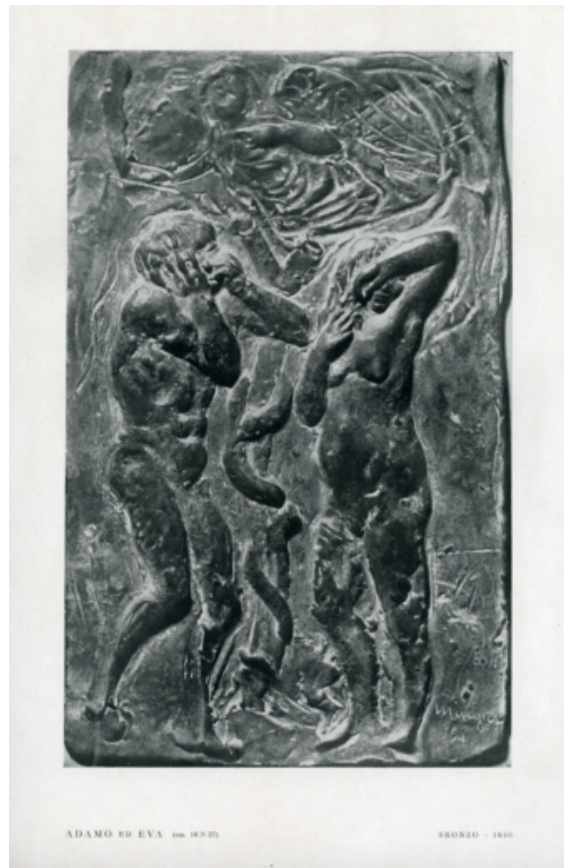
Figure 17. Luciano Minguzzi, “Adamo ed Eva” [Adam and Eve], 1940. Bronze, 10 5/8 x 6 19/64 in. (27 x 16 cm), Private collection. Published in Luciano Minguzzi. Scultore , ed. Piero Jahier (Bologna: Casa Editrice dell’Orsa, 1946).

The case is different for the male nude on the right of Marini’s Composizione . Represented in an almost humiliating nudity – with protruding belly, headgear, and lance in his hand – this figure provides a good illustration of Marini’s ongoing dialogue with one of Mario Mafai’s Fantasies . Now in the collection of the Pinacoteca di Brera in Milan, Mafai’s Fantasia (Processione) (Fantasy, [Procession], 1939–43; figure 18) depicts scenes of violence and atrocities perpetrated by the Nazi and Fascist regimes. With dense and expressionistic brushstrokes, it concentrates mercilessly on the massacring perpetrators, who, with tragic irony, are represented naked and fat, equipped only with hats, boots, weapons, and flags. 48 Marini had certainly been able to see some of Mafai’s paintings in person, for he shared an exhibition with Mafai from March 14–29, 1941, at the Galleria Genova. 49 On that occasion, two of Mafai’s Fantasies were exhibited ( Fantasia n. 7 , 1939–41, and Fantasia n. 8 , 1939–41).