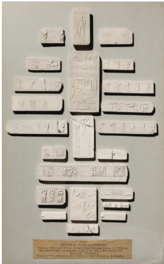
Figure 8. Marino Marini, preparatory reliefs for the Casa Littoria project by architect. Duilio Torres, 1937. Twenty-three plaster reliefs in a wooden and glass case, 2 23/64 x 18 7/64 x 28 11/32 in. (6 x 46 x 72 cm). Courtesy Iuav University, Venice, Progetti Archive, Giuseppe Torres' fund, property of arch. Giovanna Ravetta.