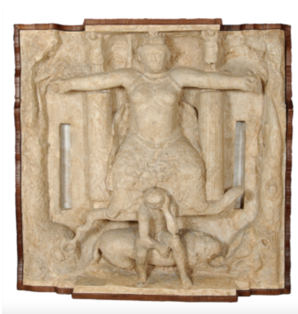
Figure 11. Marino Marini, "L'Impero affidato ai milanesi" [The Empire entrusted to the inhabitants of Milan], 1939–41. Preparatory plaster relief for the Palazzo dell'Arengario, Milan, 53 15/16 x 56 11/16 in. (137×144 cm). Livorno, Private collection.