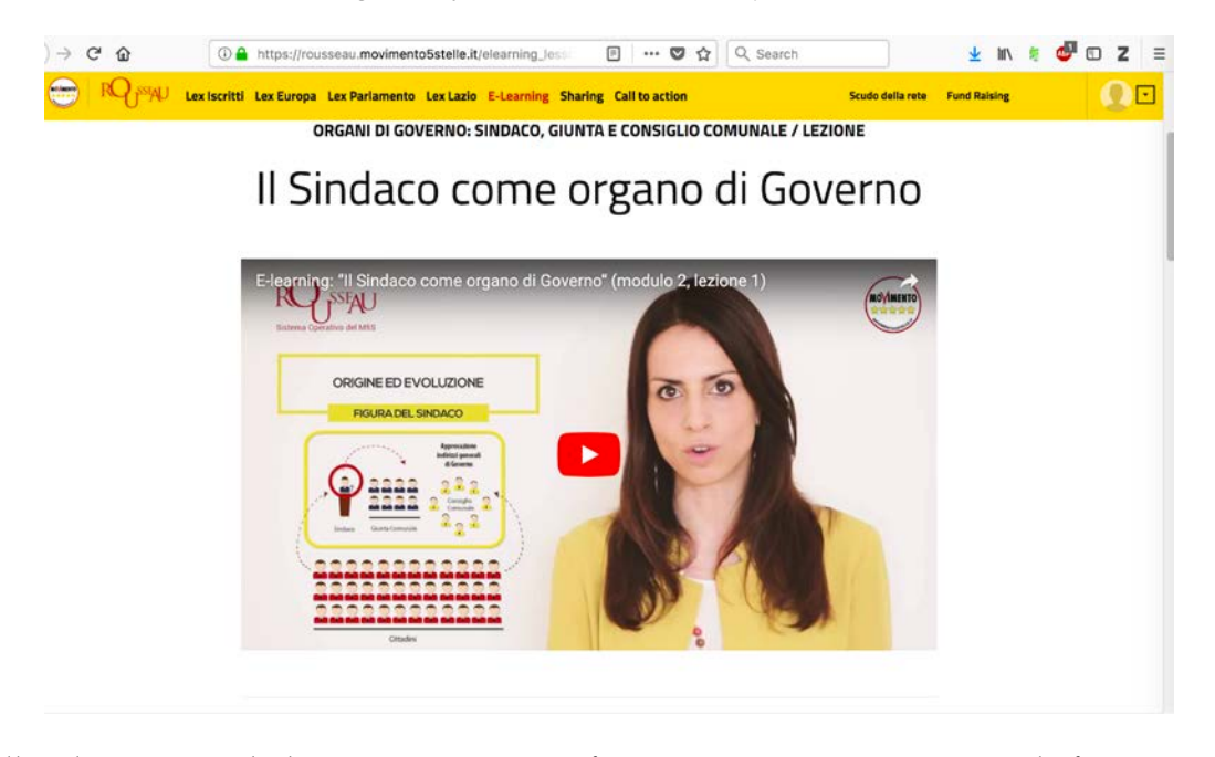
Figure 5: A tutorial in the E-learning area of Rousseau

Overall, E-learning and Sharing are meant to function as peer mentoring tools for an emerging class of citizens at their first institutional experience. In this respect, Rousseau functions also as a co-training platform, which replaces to a certain extent a political party's cadre school. To be sure, large political parties can offer their perspective cadres training programs that go well beyond counseling for inexperienced administrators. Yet Rousseau could develop this more strictly political educational function in other areas of the platform (including the still incubating Activism) in the future.