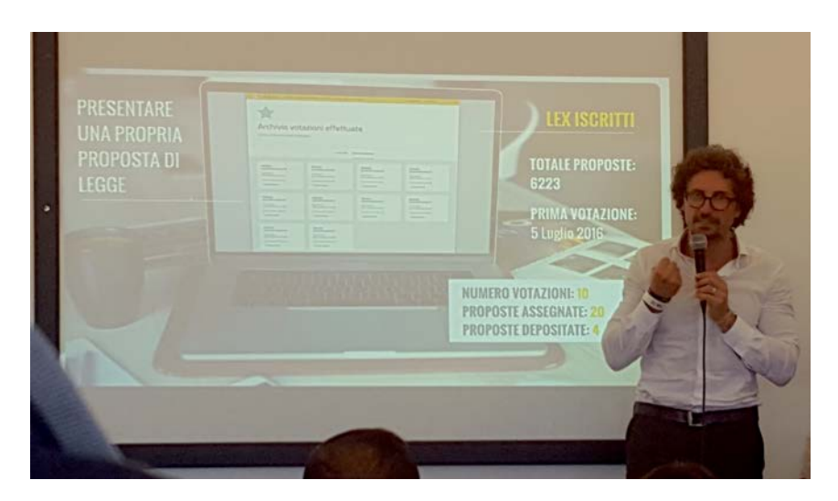
Figure 4: Danilo Toninelli presents Lex Members [Lex Iscritti], Rimini, September 23, 2017

In phase one, members draft a proposal for a bill of law. A form asks for a brief description of the bill and of its stated objective, an analysis of preexisting Italian legislation on the same subject, a comparison with similar legislation that may exist abroad, and the expertise of the proponent. Although this is not an insignificant amount of work, a cursory look at the proposals that are routinely uploaded clearly shows that the members do not spend much time researching preexisting or comparable legislation. Ultimately what matters is a clear description of the proposal and of its objective. In this respect, the threshold of access is quite low, which meets the stated purpose of making this area of Rousseau accessible to all citizens with an Internet connection and a 5SM membership.