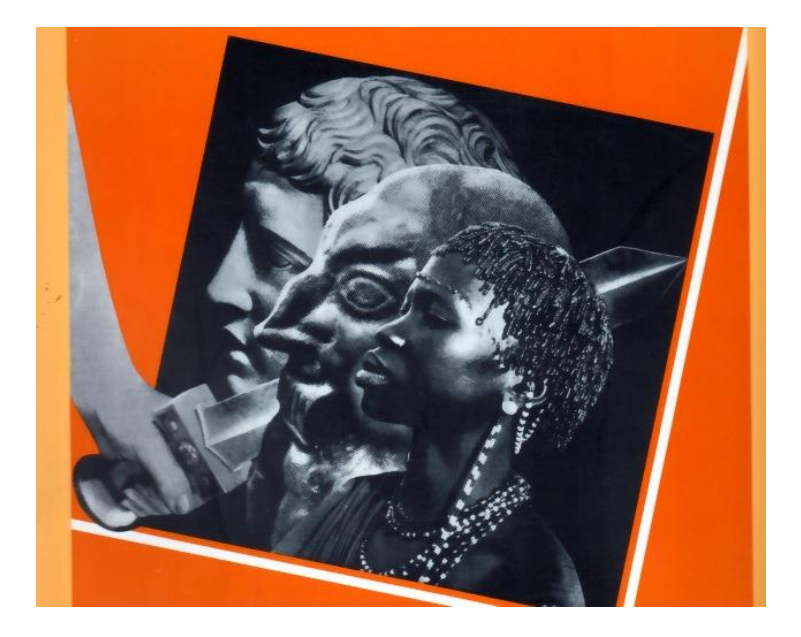
Ill. 1. La difesa della razza I/1 (1938), cover.

Mussolini's bombastic mottoes: "È l'aratro che traccia il solco, è la spada che lo difende" (the plough traces the furrow, the sword defends it).<sup>11</sup>